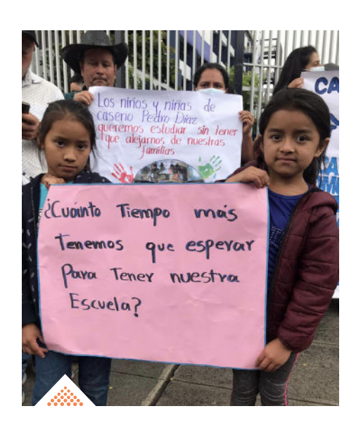
How much longer do we have to wait to have our school?