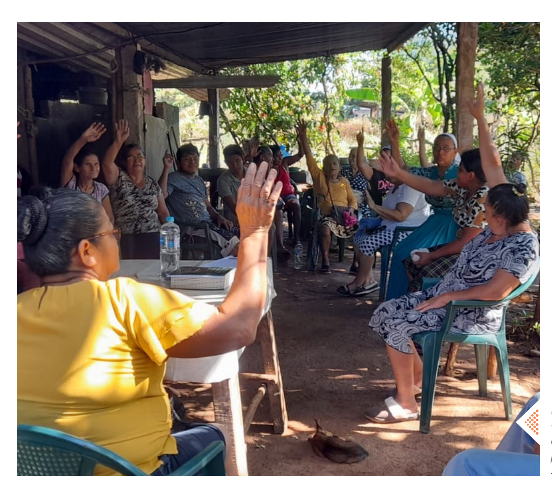
COFOA leaders voting on their development priorities for 2023.

Here are some of the local projects that COFOA leaders are working on in 2023.