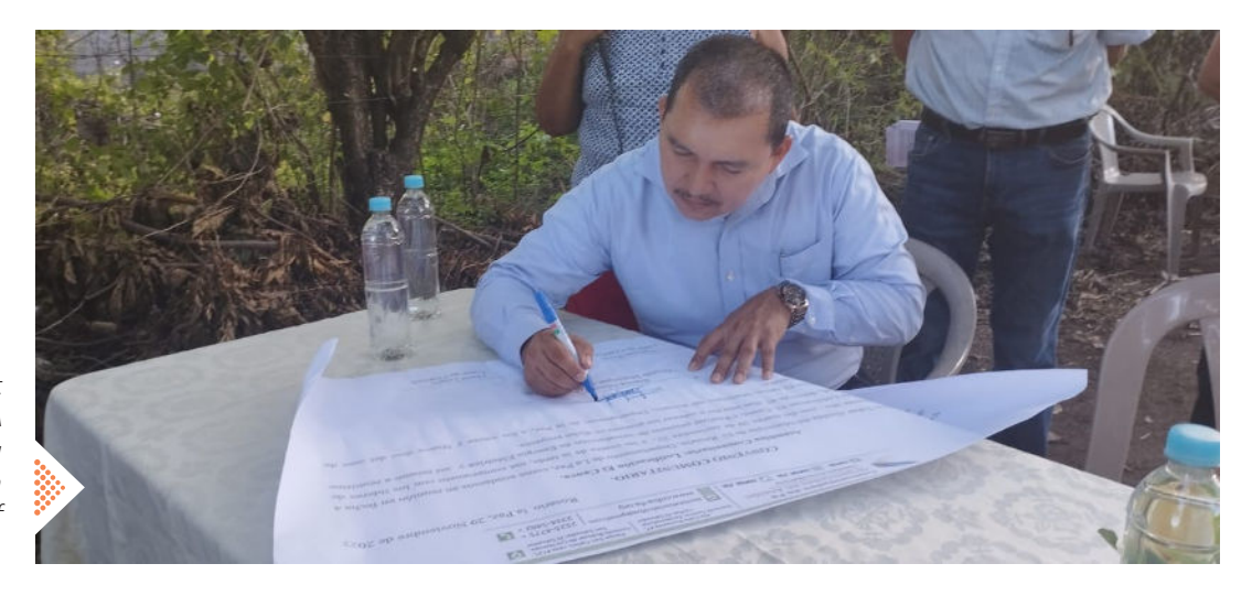
Mayor of El Rosario, signs covenant with COFOA local organizing committee from the community of Amatillo 1.

The COFOA leaders mentioned that the execution of this work amounts to an investment of $118,000 and will benefit more than 700 inhabitants of this community. The mayor promised to finish paving three more sections of this road by the end of December.