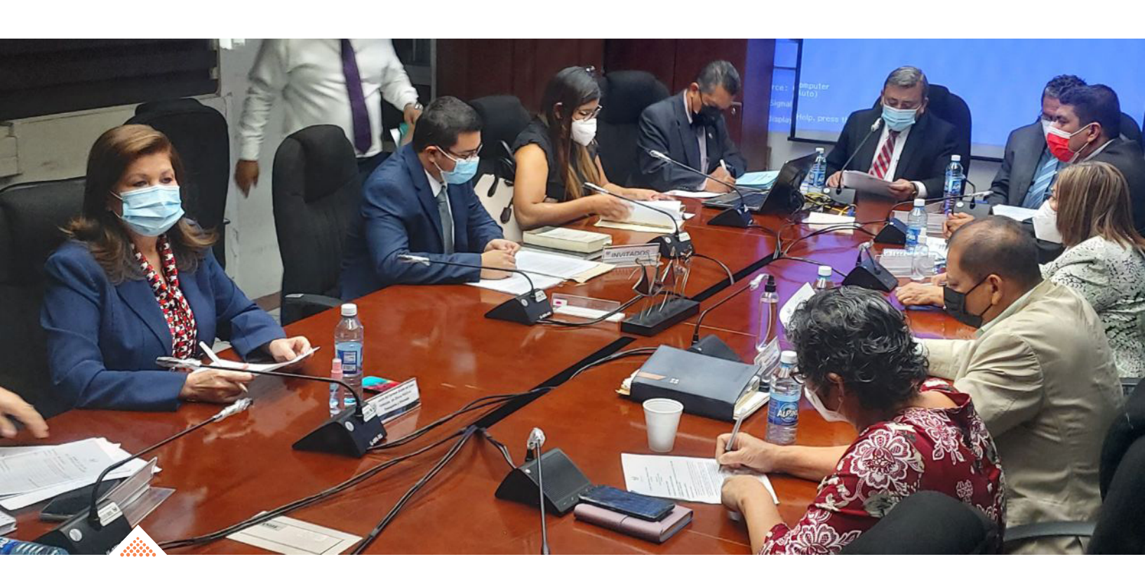
RENACER Campaign leaders meet with senior officials from the Salvadoran Government to press for progress on land titles and new, permanent legislation.

The next meeting with the Technical Committee was scheduled for March 14, 2023, at which the government institutions promised to present to COFOA leaders their proposal for reforming the Special Law for Regulating Lots and Parcels for Housing Use, with the commitment that the recommendations that COFOA has made for said law will be included.